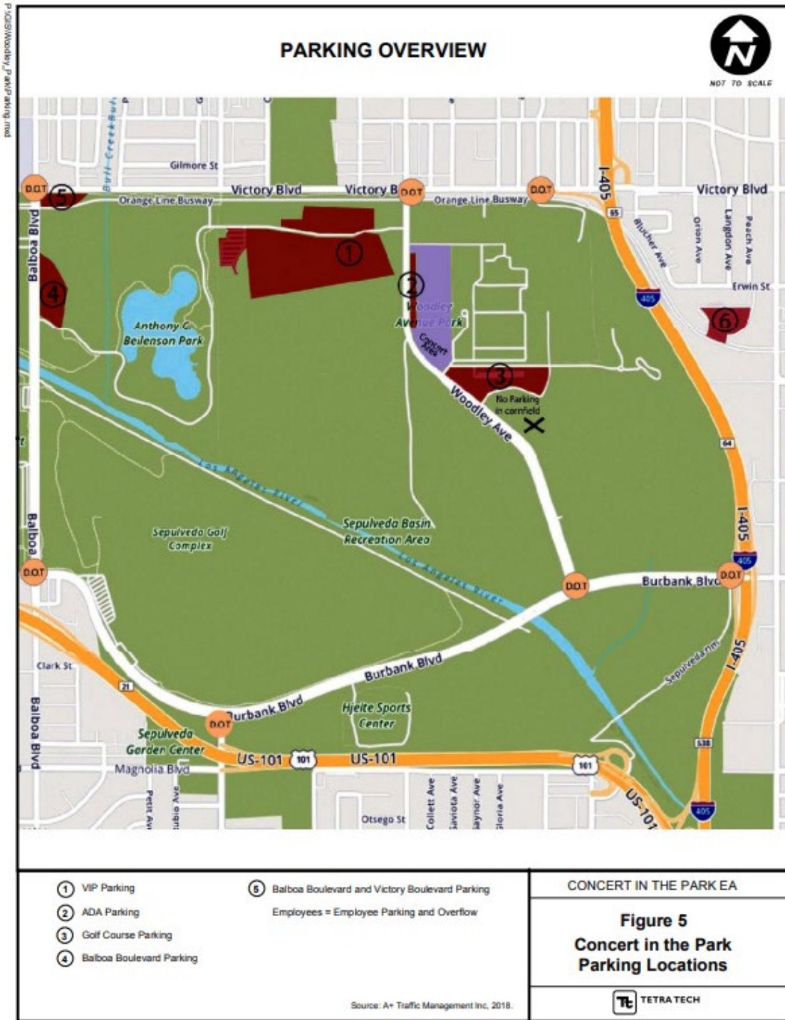
EXHIBIT D Parking Plan