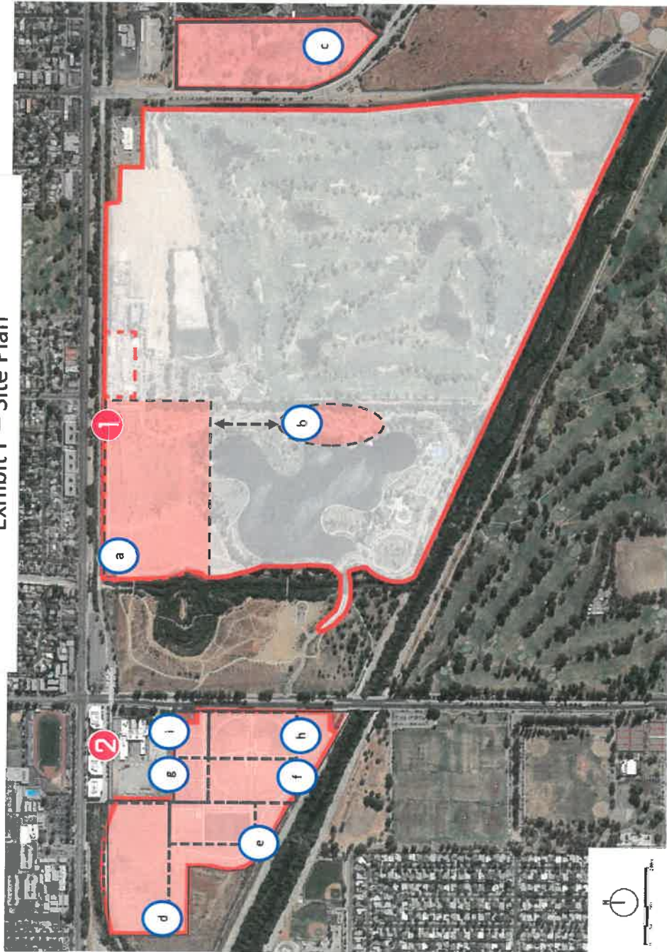
Exhibit F – Site Plan