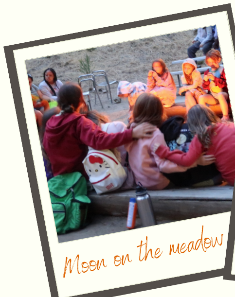
Moon on the meadow