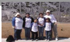
Big fenced yard w/ 2 playgrounds

Child Care Fees and Related Information: Preschool: $180.00 per month/4 weeks/per session Mondays-Thursdays