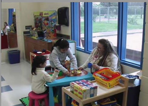
“Winnetka Child Care Center is an Epicenter of Learning and Fun”

The mission of the Child Care Program of the City of Los Angeles Department of Recreation and Parks is to provide preschool & school-age children and their families with affordable, quality child care in a safe, nurturing, and recreational environment. Our programs enhance the self-esteem, creativity, learning and social skills of the children from our diverse communities.