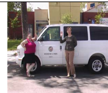
Winnetka Child Care Van for local school pick-ups

"Good Sportsmanship is Everyone's Responsibility. Be a Good Sport" .