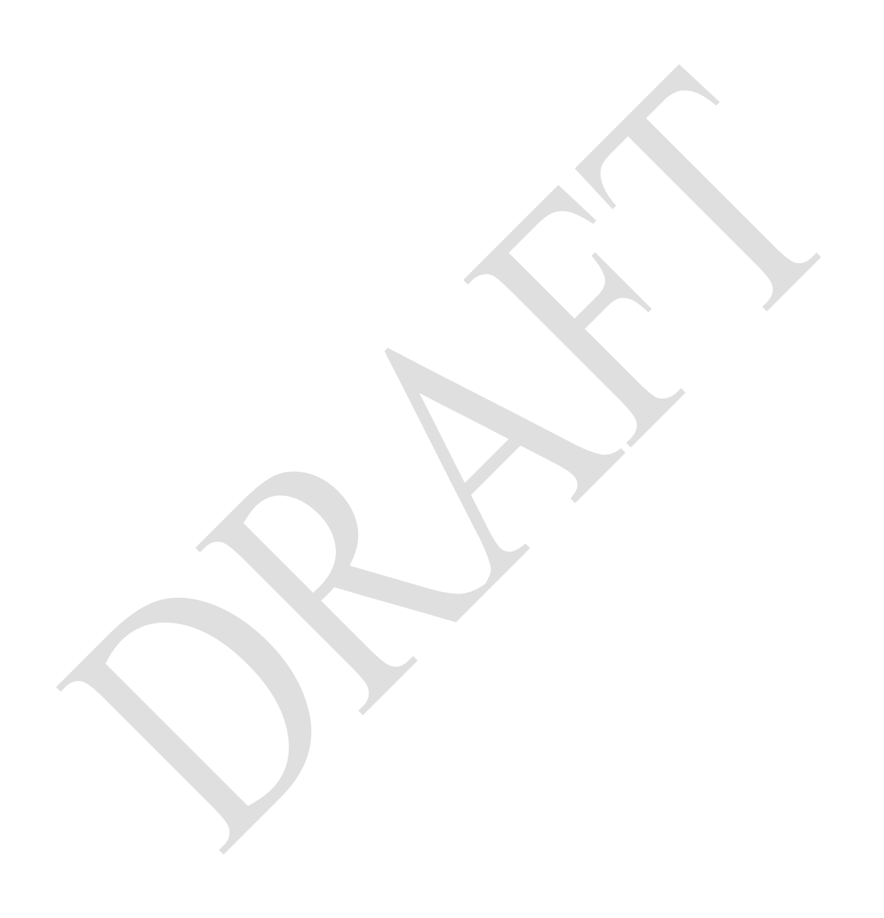
EXHIBIT "C.1" DEPICTION OF POPS