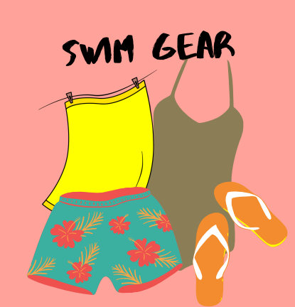
EXTRA CHANGE OF CLOTHES