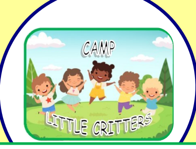
Online Registration Opens: March 5, 2024 Camper age: 3yrs-6yrs old