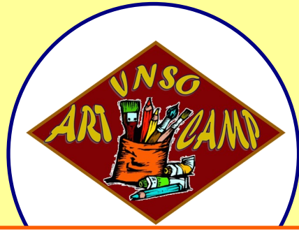
Online Registration Opens: March 5, 2024 Camper age: 7yrs-13yrs old