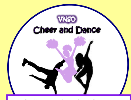
Online Registration Opens: March 5, 2024 Camper age: 7yrs-13yrs old