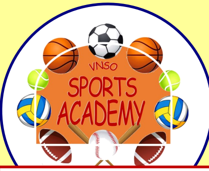
Online Registration Opens: March 5, 2024 Camper age: 7yrs-13yrs old