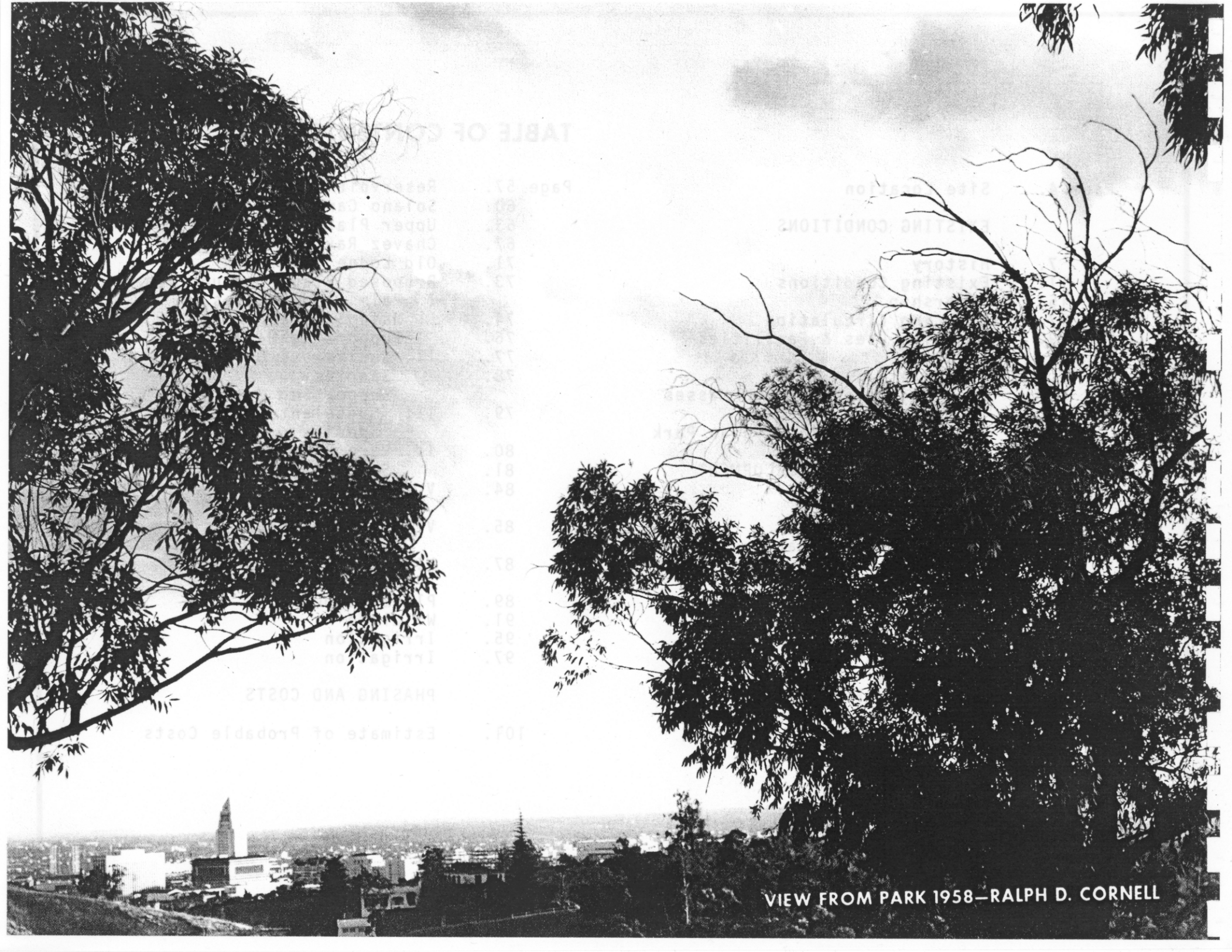
VIEW FROM PARK 1958—RALPH D. CORNELL