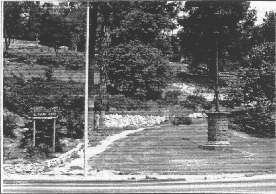
Photo 7.3: The Fremont Gate entrance off of Broadway is one of the oldest and best marked entrances to the Park, and the main entrance to the eastern area of the Park.