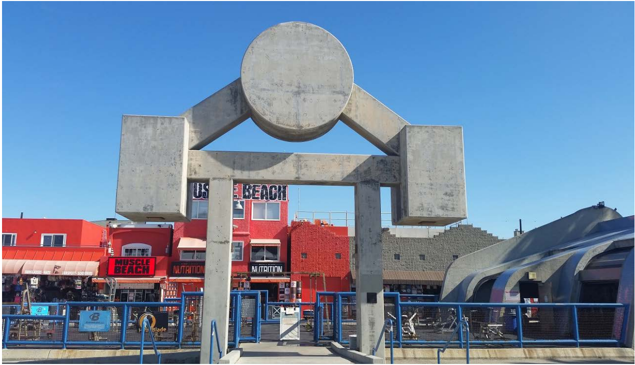
Photo of MBV STRUCTURE owned by the City of Los Angeles, and located within the grounds of Venice Beach Recreation Center and Muscle Beach Venice