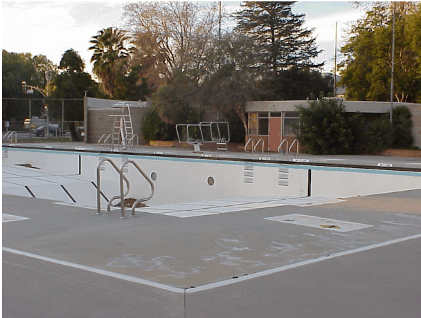
Funding has been identified to replace Northridge pool, based on a plan with input from the community

One pool served 15,657 swimmers in 2003.