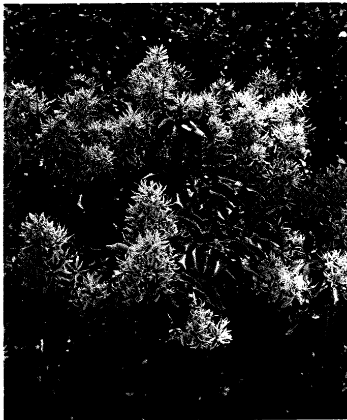
CAPE CHESTNUT FLOWERS

NOTE: This list compiled by Harold J. Teague during a survey of general masses of trees now existing in park. This list does not go into detail with respect to the botanic garden or isolated specimens.