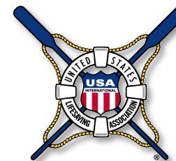
United States Life Saving Association