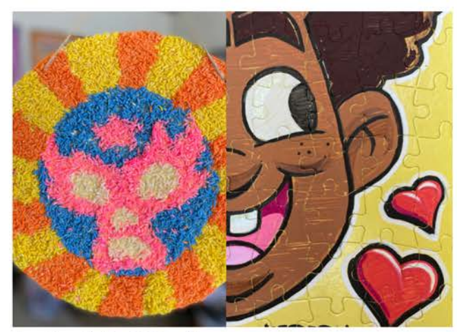
Junior Arts & Crafts TK - 2 Graders