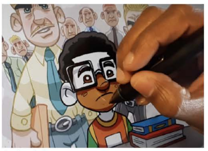
Junior Animators 3rd - 6th Graders