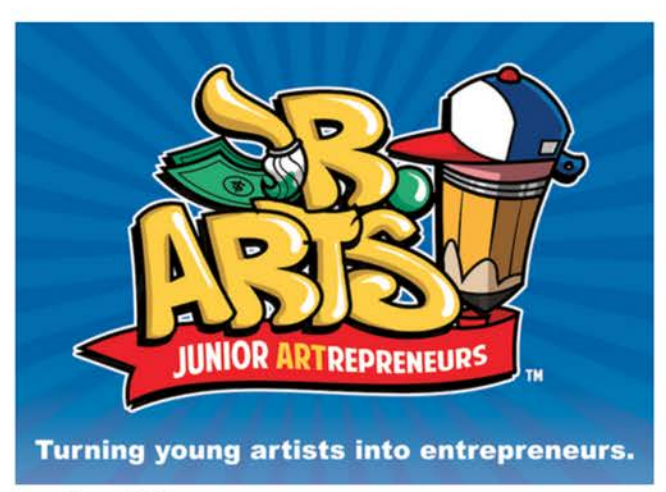
Junior ARTrepreneurs 3rd - 6th Graders