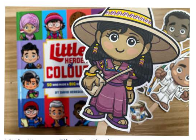
Little Heroes Film Festival TK - 2 Graders