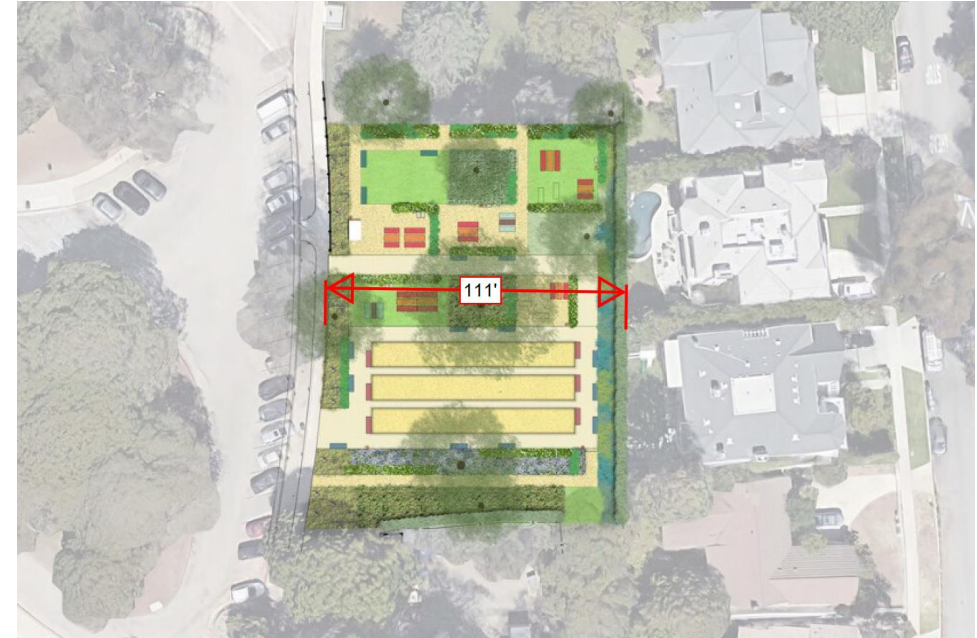
Figure 2 – Site plan showing bocce ball courts within 500' from homes on right side of image.

As seen above, noise from the blower is significantly more than 5 dB above the presumed ambient level of 50 dBA even after 5 dB is subtracted from the measured levels. As a result, blower noise is in violation of Section 112.04b of the noise ordinance. Additionally, the entire bocce ball court complex is located within 500 ft. of the neighboring house (as seen in Figure 2 below), meaning that any operation of powered blowers on these courts is in violation of Section 112.04c of the noise ordinance.