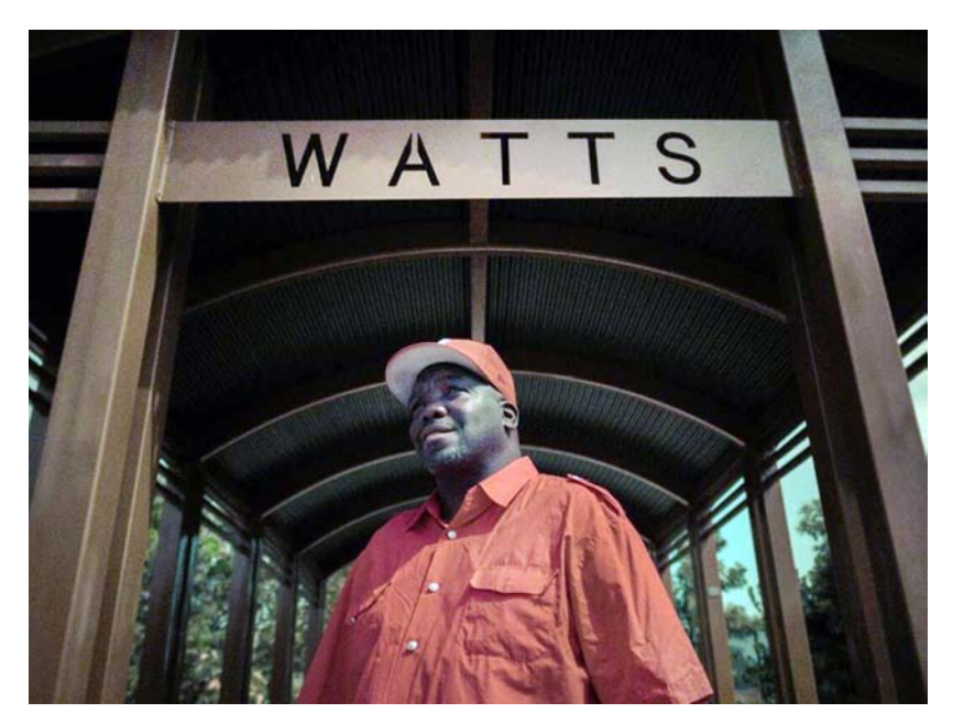
Kartoon at Watts Serenity Park