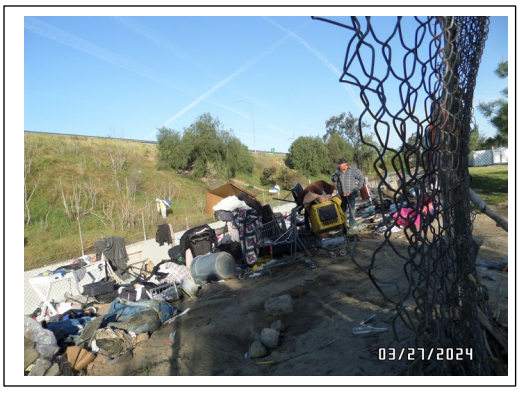
March 27, 2024 North Hollywood

My interview with two social workers on the scene of the March 27<sup>th</sup> cleaning documented abuse of the Tiny Homes. Some people experiencing homelessness maintained both a bed with free meals at a