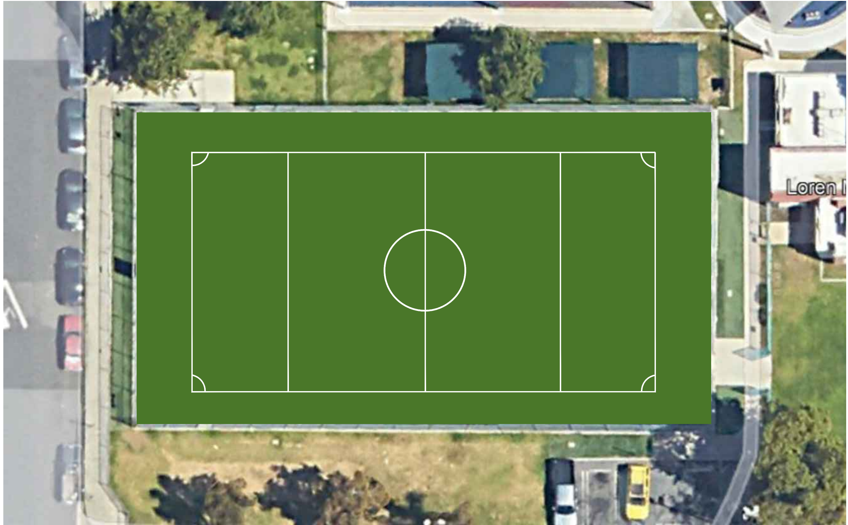
STRIPING LAYOUT SCALE: 1" = 15'-0"