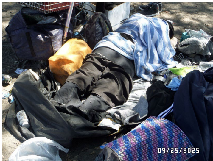
Alexandria Park Outside 200 Bed Tiny Homes