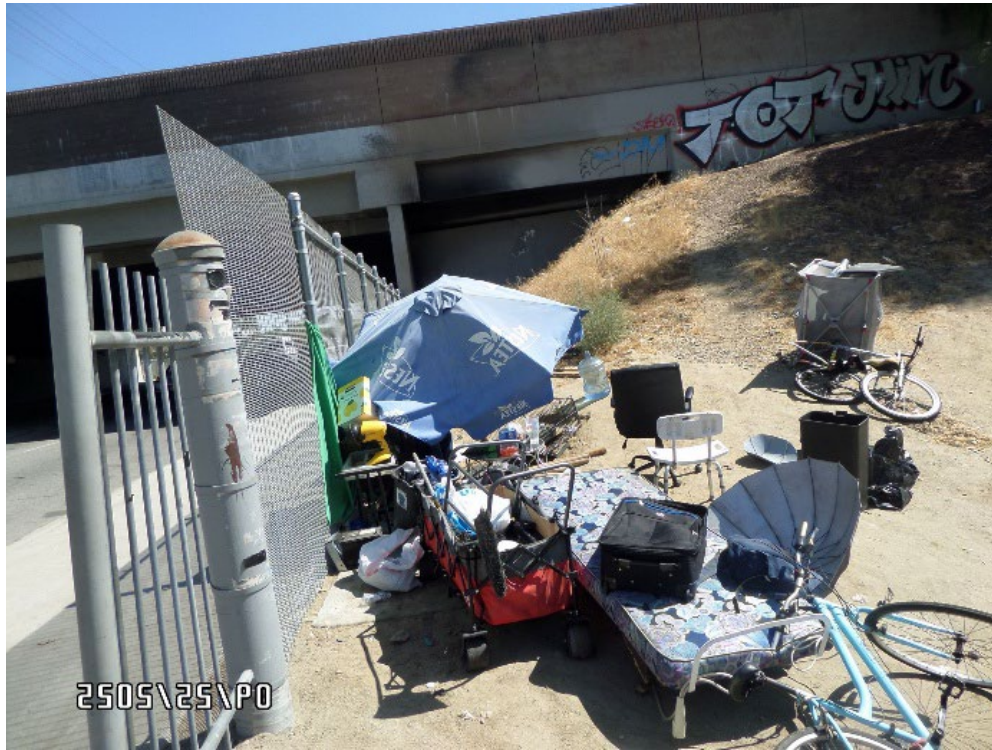
North Alexandria Park (East of 170 Freeway)