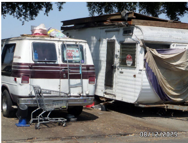
2024 Photo of St. Clair St. next to park

A Rec and Parks maintenance staffer repairs irrigation pipes at Laurel Grove Park, September 25, 2026.