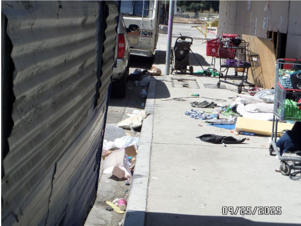
East Park Entrance