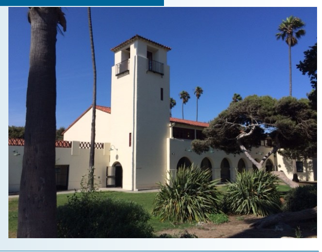
Outdoor Lawn Area & view of sunset from the Outdoor Area