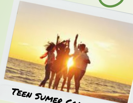
TEEN SUMER CAMP 2024