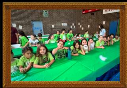
SHREK DINE AND FILM