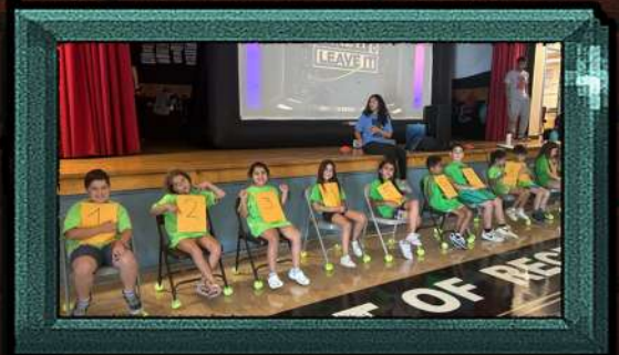
DEAL OR NO DEAL