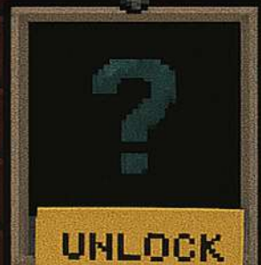
UNLOCK IN 2026