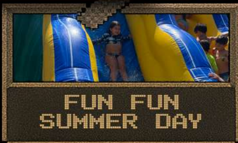
FUN FUN SUMMER DAY